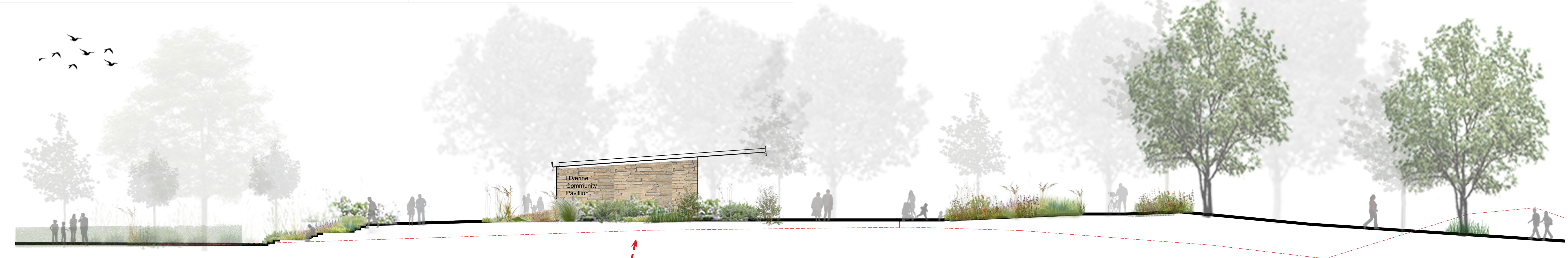
Cross section B Zoomed in Section of Community Pavilion Scale: NTS *See red dashed line for extents